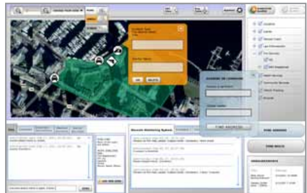
Figure 1: JEPRS Common Operating Picture

JEPRS is a real-time crisis and planned event management solution that employs the newest and most effective GIS technology over a detailed photographic mapping interface.