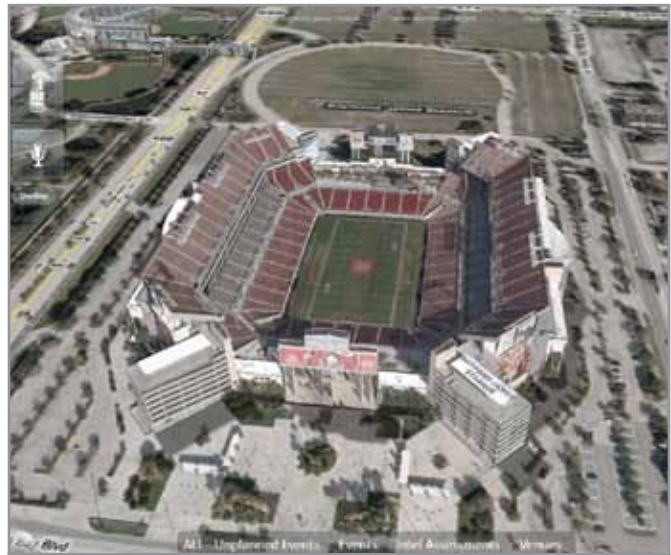
Figure 4: Situational Awareness Drawing upon data from the integrated Microsoft Office SharePoint Server, detailed reports that summarize specific incidents, their location, and status are viewed quickly and easily.